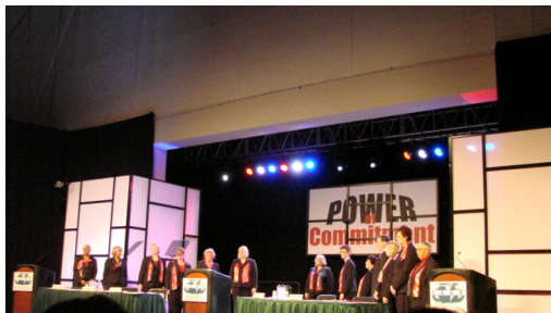
2010—2011 International Board