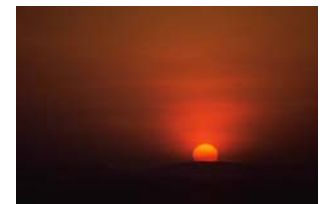
Enjoy the sunrise