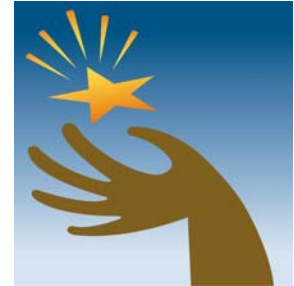
Reach for the Stars – You Never Know What You Will Find